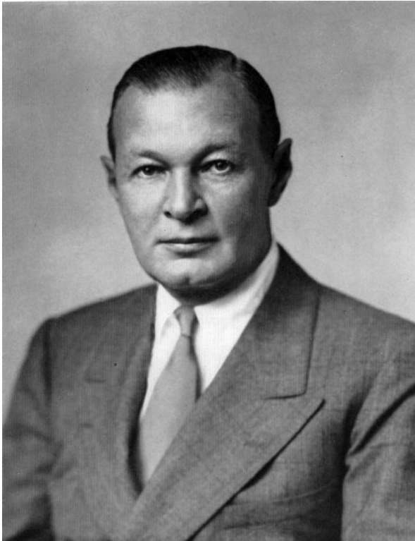
Frederick B. Rentschler, founder of Pratt & Whitney Aircraft

Frederick Brant Rentschler turned his back on the family foundry business to become an Army engine inspector at the Wright-Martin Company during World War I. When the war ended, Wright-Martin was reorganized, and Rentschler stayed on to become President of Wright Aeronautical Corporation. But Rentschler was unable to convince the Wright Board of Directors, composed largely of investment bankers with little knowledge of aviation, to fund research necessary for continued improvement of air-cooled engines. 1 Such philosophical differences led Rentschler to resign from Wright on September 1, 1924 2 .